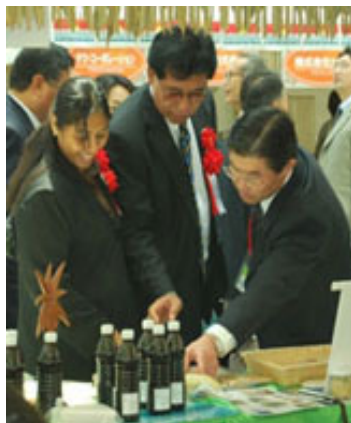
President Mori & First Lady at the Pacific Islands Exhibition 2009 in Tokyo, Japan