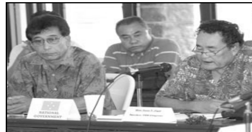
H.E. President Emanuel (Manny) Mori, sitting at left, is addressing the 2nd State-National Leadership Conference, May 14, 2009 at Central Facility in Palikir, Pohnpei

Yesterday, May 12, 2009, the second State-National Leadership Conference began in Palikir, Pohnpei with principals from all 5 FSM Governments. In atten-