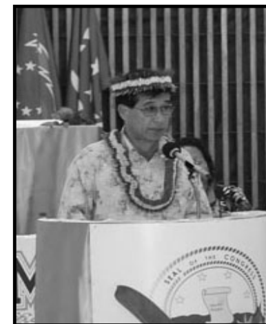
Delivers Message—The President Manny Mori, at podium, delivering his 2nd State of Nation Message on May 14, 2009 to the FSM Congress

Today, May 14, 2009, President Mori stood before Congress and a full chamber and gave his second State of the Nation Address. The address was attended by Vice President Alik, the members of the 16 th FSM Congress, Chief Justice Amariach, former Presidents Leo A. Falcam and Joseph Urusemal, the resident Diplomatic Community, members of the President's Cabinet, state governors, employees of the National Government and the public. The speech was broadcast live over the radio in all four FSM States via FSM Telecom and will be released to public television with the day. After welcoming all leaders, dignitaries, and the public who were in attendance and listening live on the radio, the President got into his speech by recognizing the 30 th anniversary of the FSM Constitution that was signed on May