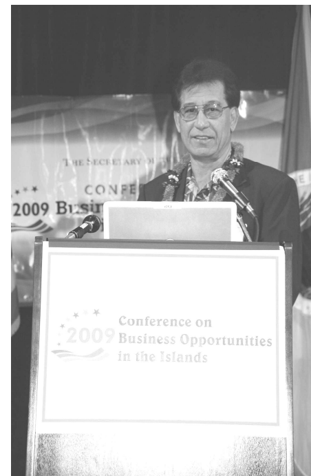
President Mori Address Businessmen In Hawaii

Honolulu, Hawaii – On April 6, 2009, His Excellency Emanuel Mori, President of the Federated States of Micronesia, delivered a statement during the opening ceremony of the "Conference on Business Opportunities in the Islands" to an audience of business and government leaders from the United States, territories and Freely Associated States.